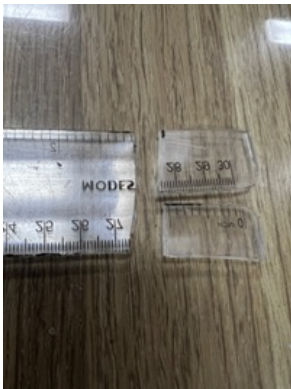
Detached end fragments

Just when you thought office work was the safest gig in the world... the stationery decided to go BOOM!