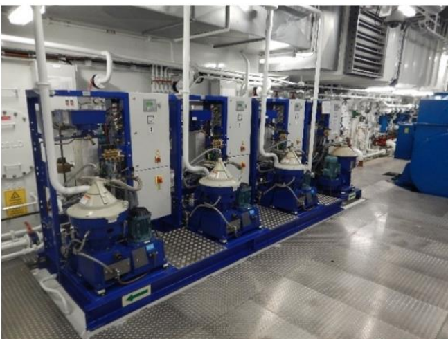
LO separator – MDO purifier rack

The electric motor junction box cover was removed, and access to the wiring was good. Measurement was carried out using a multimeter. When he was about to replace the cover of the junction box, it touched one of the three phases and he suffered a minor electrical shock in his fingers. He was uninjured but had himself checked by the medic who confirmed this.