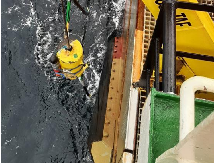
Location of fender in relation to beacon on the Headache Ball

During recovery of tugger winches on an A-frame workstation, the headache ball experienced normal movement when exiting the splash zone. However, in this instance, the headache ball came into contact with the vessel fender and damaged an acoustic beacon. The damaged beacon was taken out of service and repair arranged.