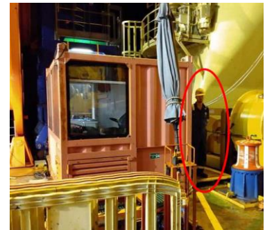
Place where the MLDW operator stood